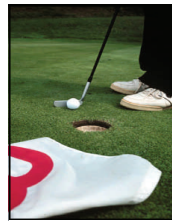
USED ON AREA GOLF COURSES & IN YOUR NEIGHBORHOOD!

Give new life to your existing lawn; Topdress annually by applying a thin, even layer over existing turf grass.